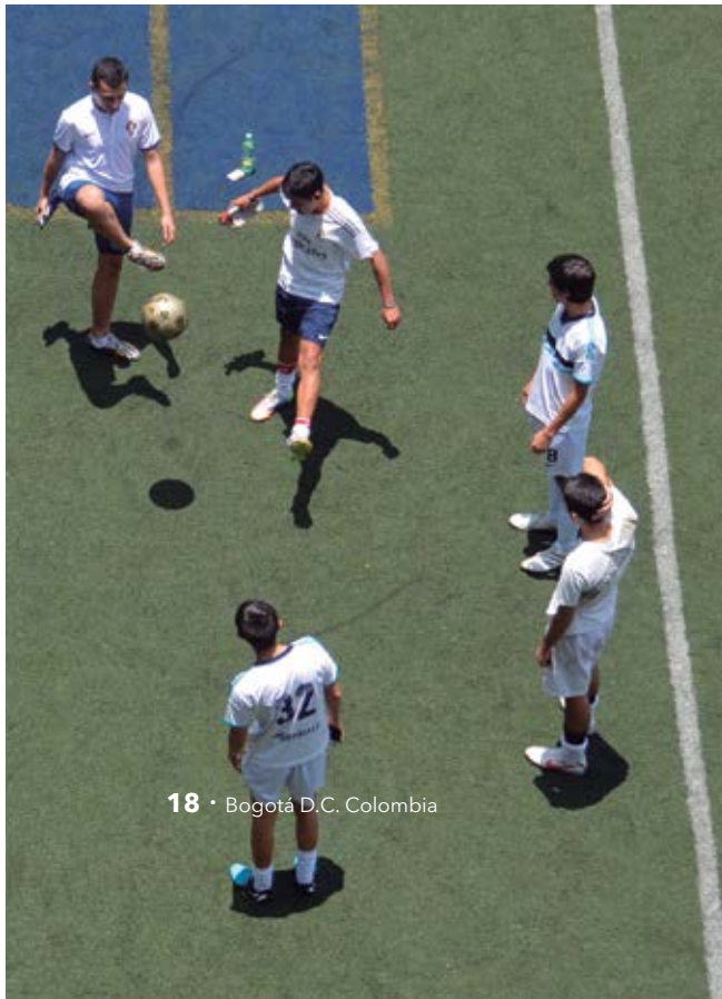
18 • Bogotá D.C., Colombia

The Sports Formation Center of Javeriana offers spaces to practice physical exercise and sports. It is open from Sunday to Sunday, extended hours, and it has wonderful arenas and state-of-the-art equipment. The sports system allows students to be part of one of the 120 teams of the different Schools or of one of the University Teams that have won regional championships for more than 6 years and that successfully participate in the National University Games.